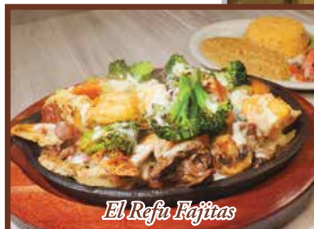
El Refu Fajitas