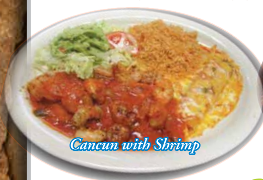
Cancun with Shrimp