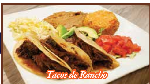
Tacos de Rancho