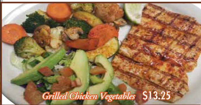
Grilled Chicken Vegetables $13.25