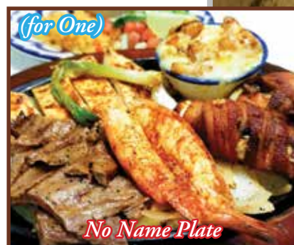
No Name Plate