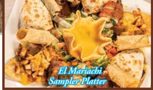
El Mariachi Sampler Platter