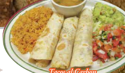
Tacos al Carbon