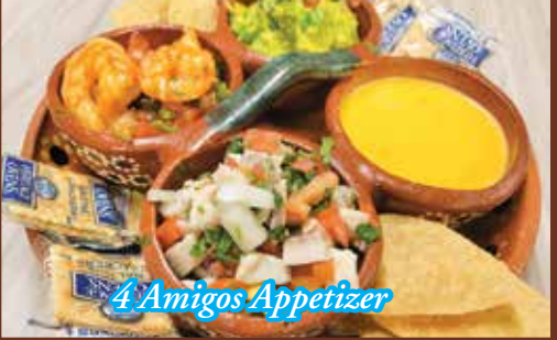
4 Amigos Appetizer