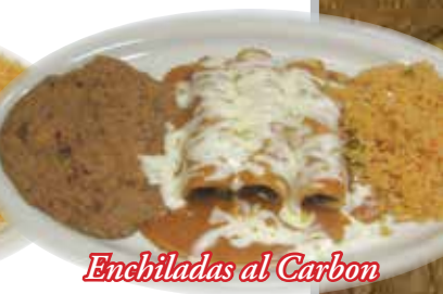
Enchiladas al Carbon