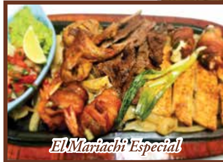
El Mariachi Especial